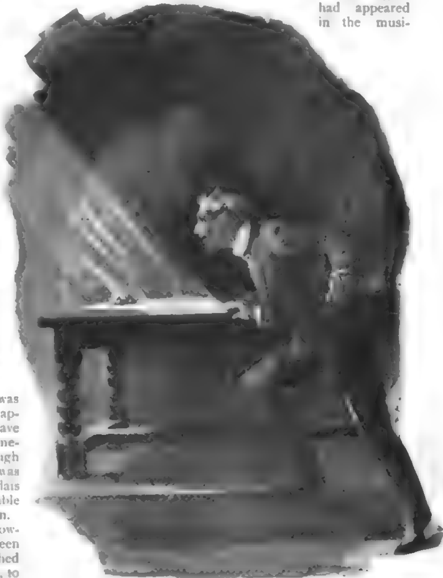
I saw a rose, a rose of the palest yellow or white.

Then I was aroused by a sound which clearly belonged to the world of reality. It reached me from above, and on looking up I saw that a figure had appeared in the musi-